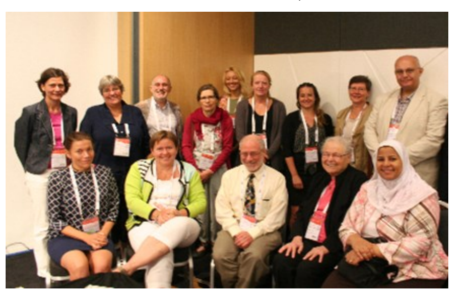
Members of the Cataloguing committee in Singapore 2012.

The ISBD is one of the most successful standards developed within IFLA but at the same