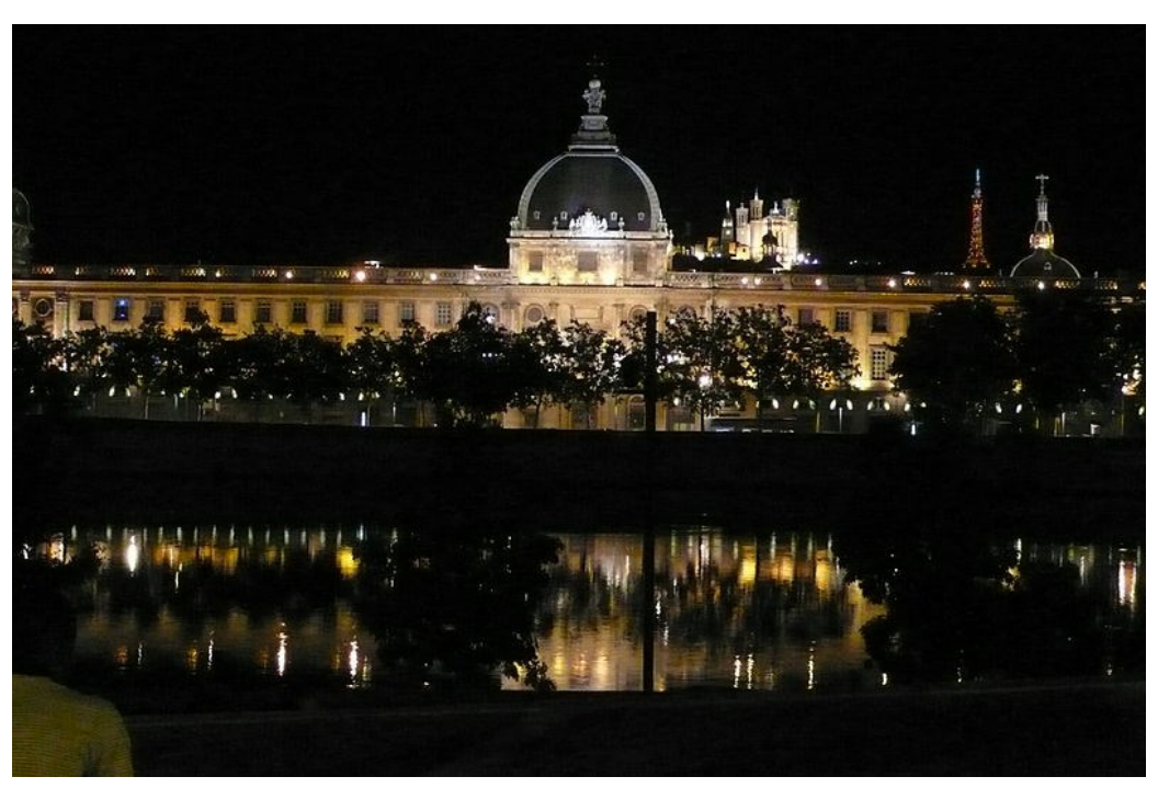
View of Lyon by night from the east bank of the Rhone River

"Universal Control in the Digital Age: Golden Opportunity or Paradise Lost?"