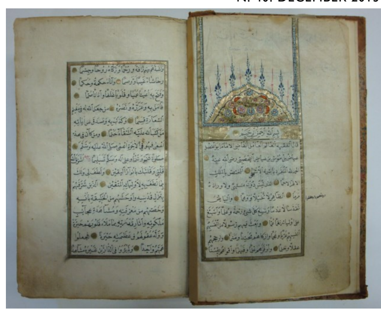
Manuscript of the Islamic manuscripts collection (inv. no. 107)

A website dedicated to the Paul Kahle Fonds and the KADMOS project has been created: www.paulkahle.unito.it. The whole database