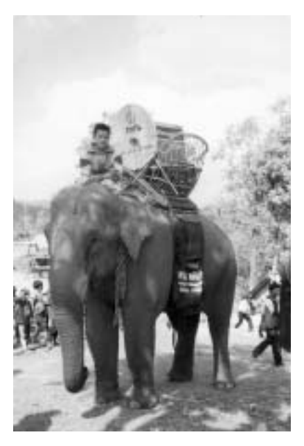
Elephant delivery in Thailand.

Elephants are used to carry information and educational ma-