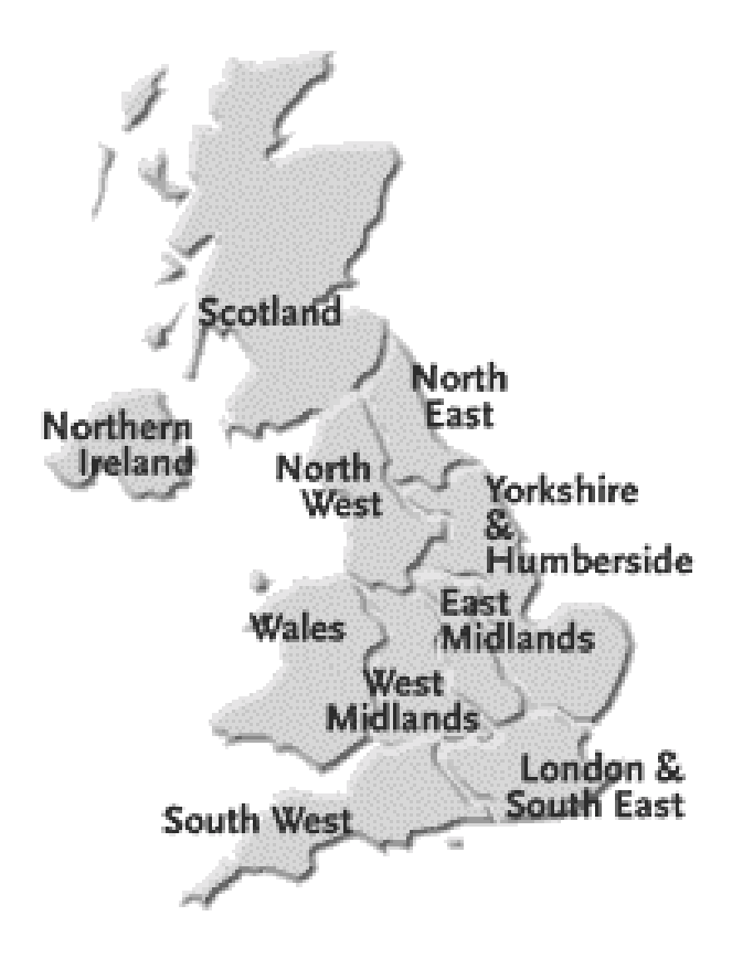
Figure 2. The ten NEWSPLAN Regional Groups.

The support for the Project from industry clearly demonstrates that the industry is willing to collaborate in the 'national interest' to assist in saving a vital part of the country's history. It also, uniquely, is evidence of an industry assisting to preserve what it has produced for the last two centuries. The support from the regional newspaper industry is vital for the success of the Proj-