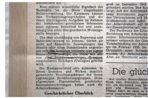
Fig. 6: Text background, folded pages