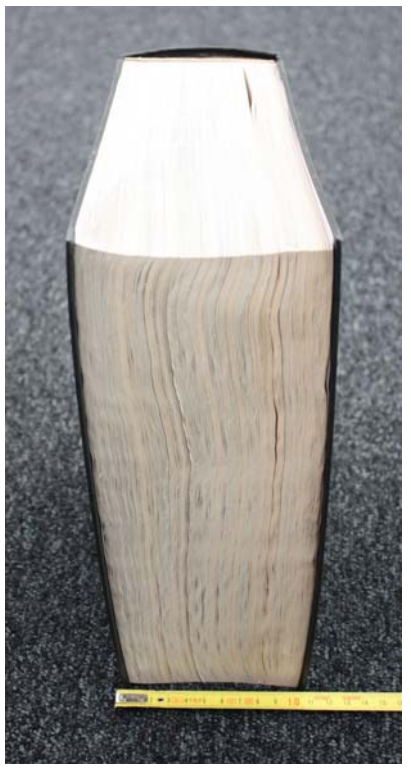
Fig. 1: Book thickness