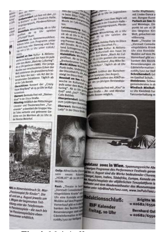
Fig. 4: Moiré effect