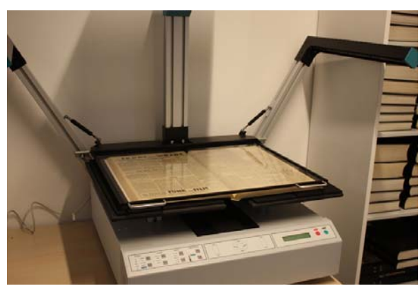
Fig. 9: Manual book scanner