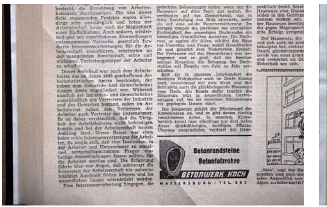
Fig. 5: Creased, buckled page