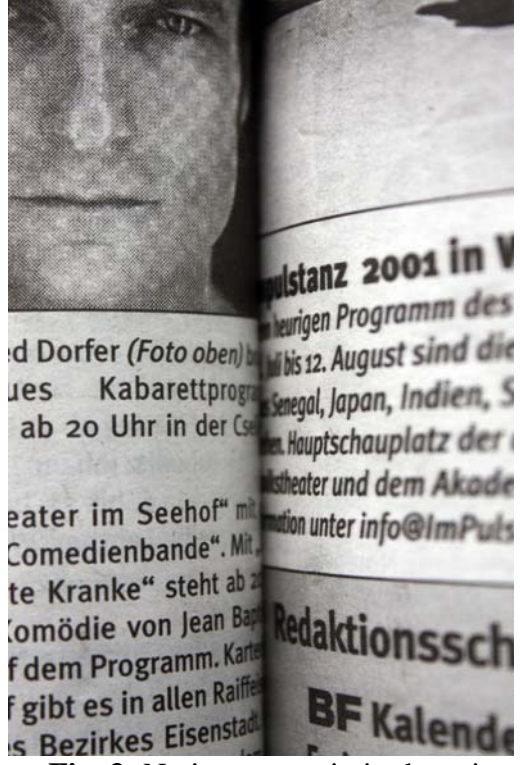
Fig. 3: No inner margin in the spine