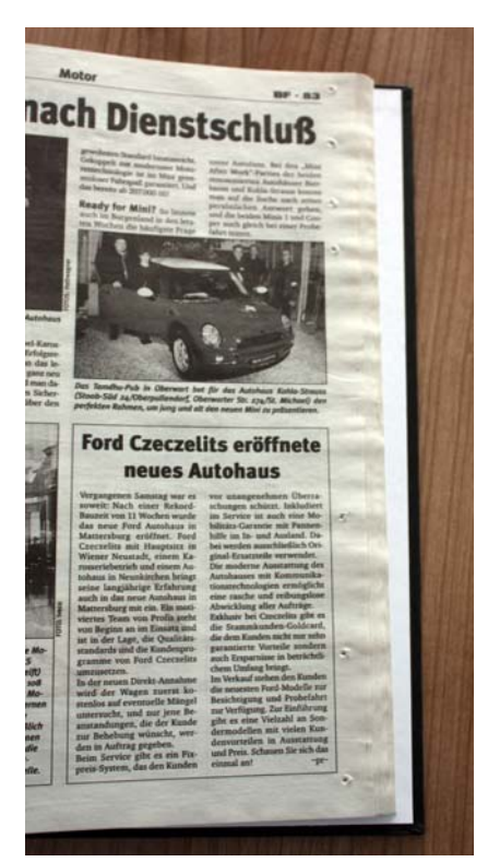
Fig. 2: Wavy pages