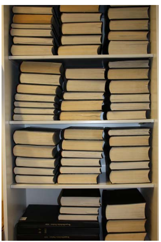
Fig. 8: Shelf with small books and in the lower part the big size books