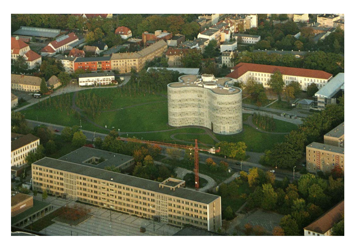
III. 1: The position of the ICMC building<sup>1</sup>

The amazing external architecture continues internally with a spiral staircase extending from the 1<sup>st</sup> to the 6<sup>th</sup> floor, and a striking color scheme (in vibrant yellow, green, magenta, red, and blue) for parts of the floor covering and walls. In addition a further characteristic of the building is that within the ground plan none of the floor plans are the same. With the exception of the management and business areas (7<sup>th</sup> floor) and the technical and pool areas (1<sup>st</sup> and 2<sup>nd</sup> underground level) there are only a few truly separate areas. This allows a flexible and open concept for the use of the building which consciously allows for many work and communication forms for single users or user groups. The work and reading areas are in coves related to each of the floors, while the open access stacks of the library - floor related - arranged according to subject areas are located in the core of the building.