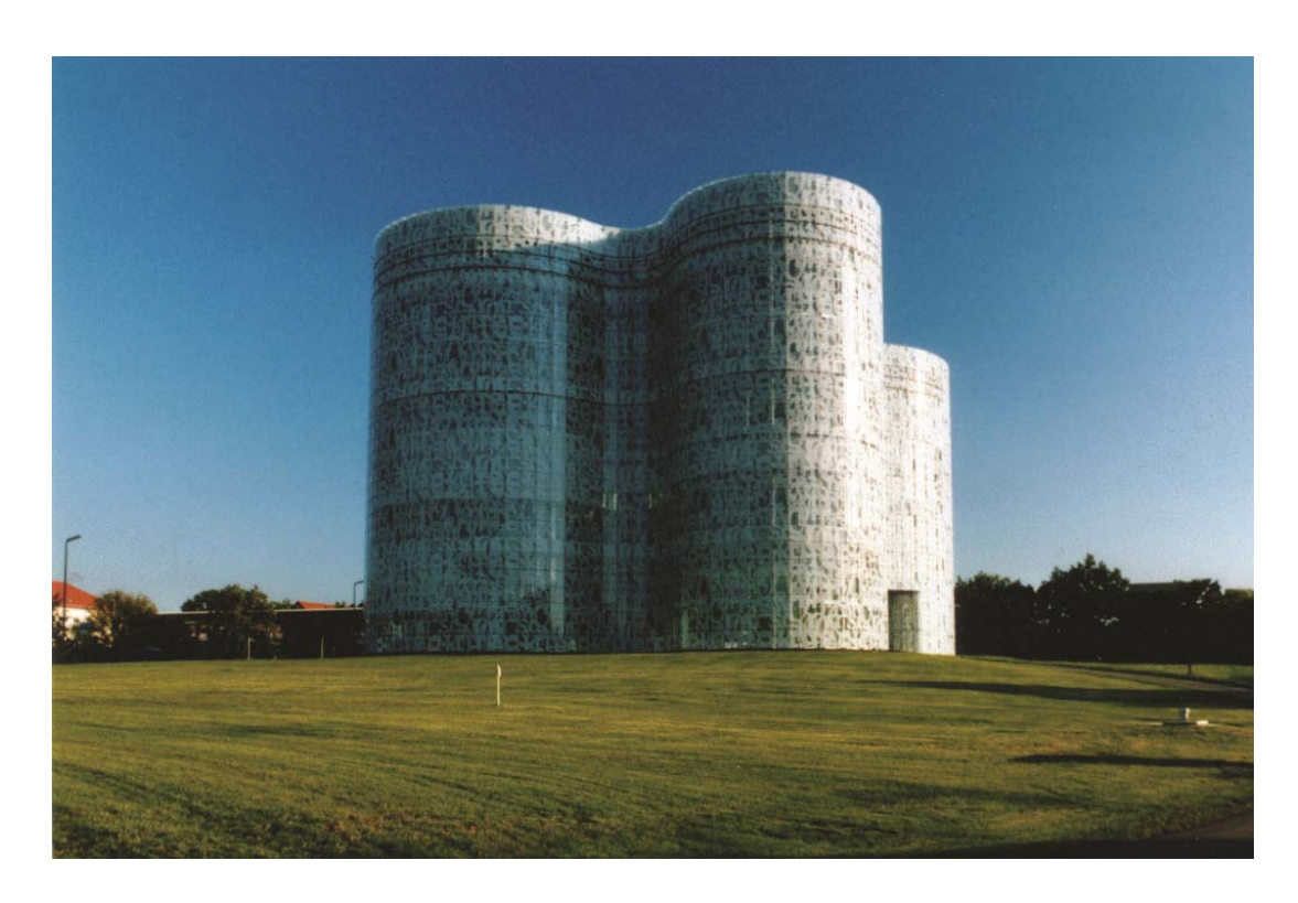
III. 2: The IKMZ building by Nordwestern

The fact many different people generally use libraries, even though Internet access is not subject to the constraints of time and place, is not generally related to the architecture of library buildings – for libraries continue to be indispensable as places of academic study. However, when a library becomes a tourist attraction, its architecture usually does have something to do with this development. Since the building of the ICMC/IKMZ of the Brandenburg Technical University Cottbus was opened in February 2005, it has been visited by approximately 20,000 tourists. In the tangible field of tension created by the design of an Alvar-Aalto vase and the impression of a 'Castel del Monte', the architectonic sculpture that is the ICMC/IKMZ building has become not only an architectural highlight, but also a symbol of the university, the town and the region<sup>2</sup>.