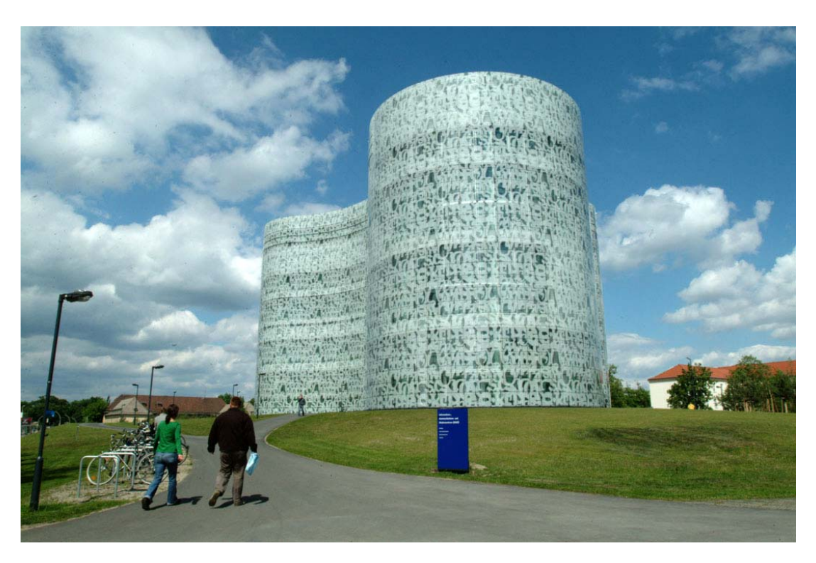
III. 3: The IKMZ building from the South

words, the building's functions could be realised without always having to adopt triedand-tested models, and executed as an architectural experiment, paying attention to the requirements of a library building. In this connection, the decisive question is whether the library building has both the components of a central reading room traditionally considered essential and a clearly identifiably stacks; for it is these two parameters that transform a building designed in accordance with traditional criteria into a library.