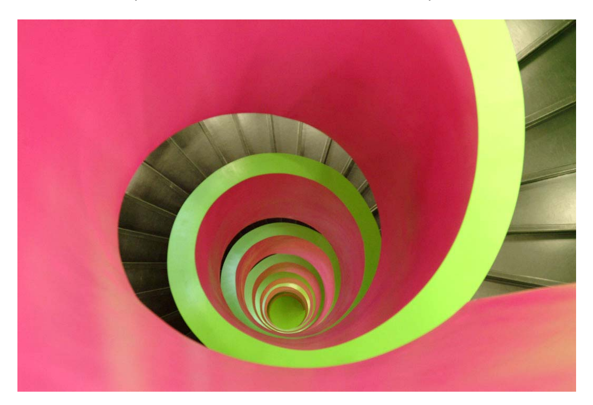
III. 8: The "spiral staircase" as seen from above

plausible because it is not so much a building's equipment that is at issue here than its basic building structures. As long as the impact of traditional structures remains the decisive issue, buildings will remain committed to tradition: the use of materials such as aluminium, glass and reinforced concrete will not change this in any way. But if a "third place" is characterised as a library by its façade, thereby dispensing with the central structural elements of a traditional library building, then a new and different quality will be in demand, one that is – as things now stand – more appropriately referred to as an "experience" or a "adventure" than as "best practice".