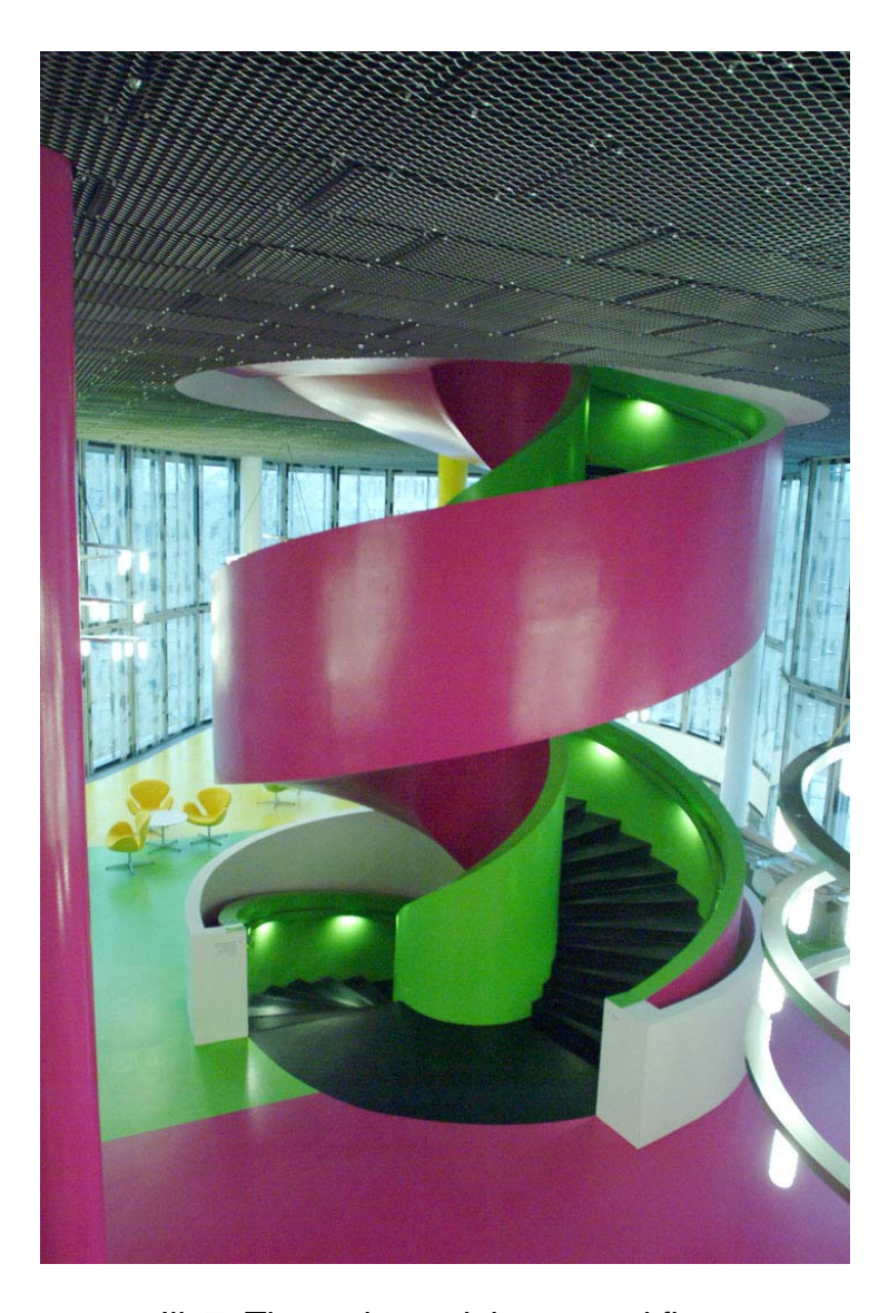
III. 7: The stairs and the ground floor

Expressed more concretely, the question is: are libraries primarily places of concentration, and peace and quite, or are they first and foremost places of work and communication? This question forms the title of a dissertation by Michael Dufter, which contains a comparative study on the impact of various architectural concepts – as exemplified by the Saxonian State and University Library / Sächsische Landesbibliothek - Staats- und Universitätsbibliothek (SLUB) Dresden and the ICMC/IKMZ of Cottbus University. To back up the results of the study statistically, users were questioned and their replies evaluated. Decisive here is the fact that the two library buildings' acceptance and assessment were assessed on the basis of functional and aesthetic criteria. Dufter summarised the results as follows.