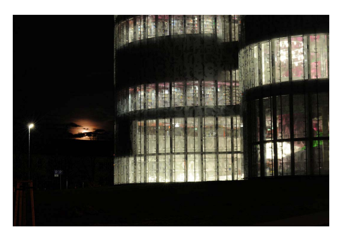
III. 4: The IKMZ building from the south-west

A remarkable feature of the description supplied by the architects Herzog & de Meuron<sup>4</sup> is the matter-of-course way in which it addresses the architectural implementation of the building's library function without, however, going into considerable detail. Priority has evidently been given to creating forms and structures that relate to the building and its urban setting. The architects focus on discussing the tensions between the round and angular forms, the flowing spatial continuum and orthogonal systems, as well as on movement, light and the material. As a result, the library functions seem to be more of a pretext than a reason for choosing this particular architectural design. The façade, which is printed in the lettering of diverse languages, is supposed to illuminate the building's function. In other words, it is the mystifying impact of the printed lettering, and not primarily the room concept, which articulates the library that constitutes the ICMC/IKMZ. At the same time, the façade, which enigmatically disguises the building during the day, brings "light into the darkness" by night. Furthermore, thanks to the powerful colours of the spectrum on the interior, it transforms the ICMC/IKMZ building itself into a medium, adding greater intensity to the library-construction experiment.