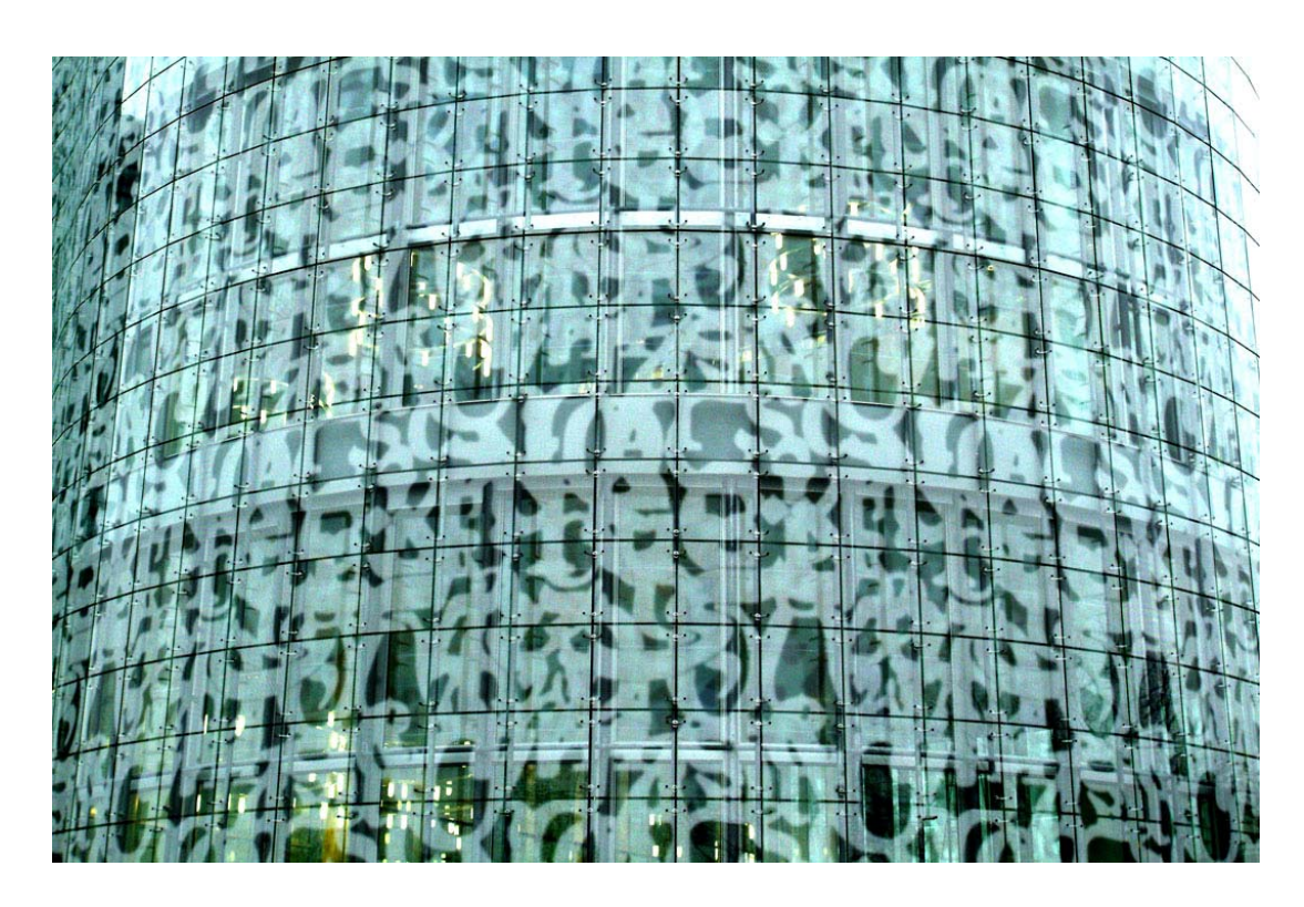
III. 5: Façade detail on the IKMZ building

In what other ways does the IKMZ structure build the "future"? The expansion of the Internet as a distribution channel for library-related content has transformed the architectural self-image of libraries forever. Libraries' function as stores for physical units of paper-bound media evokes the metaphor of the treasure chamber and the receptacle of knowledge. Decisive for the value of library stocks is their function as a memory and as a reservoir of handed-down human knowledge. The library's exclusiveness is legitimated in this model handed down from the past and justifies itself thereby as a "castle of the holy grail of knowledge". With some overstatement, one might say that the quasi-sacred tradition of the human memory is under lock and key and primarily available to the "community of the initiates", or those who endeavour to acquire and deepen their knowledge as scholars.