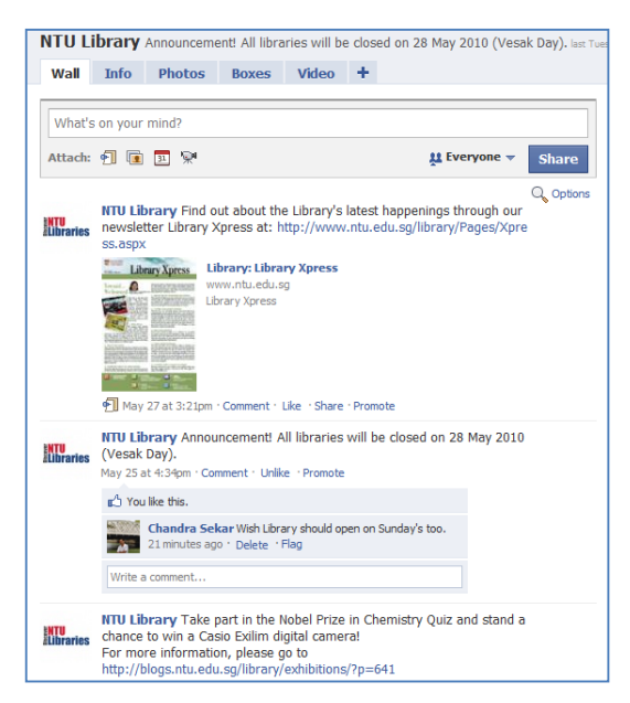
Figure 2: NTU Library Facebook Page URL: http://www.facebook.com/ntu.library

As of May 24th, 2010, we have a total of 1,315 fans with over 80% in the 18-34 age groups. We have noticed a surge of activities when NTU Library organised major outreach events such as Freshmen Orientation and eResources Day. It was evident that the "viral marketing" characteristics of Facebook community helped to multiply our publicity efforts many folds. When a user becomes a fan (or likes) of our Facebook Page, all of his/her friends are informed. It is likewise, when librarians comment on someone else's status update, their network of friends view the comments too. One fun and engaging idea was inviting users to photo-tag the pictures which NTU Library had uploaded