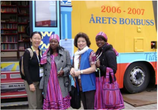
Posing with my new-found friends from Namibia and Japan outside the new Kungsbacka book mobile