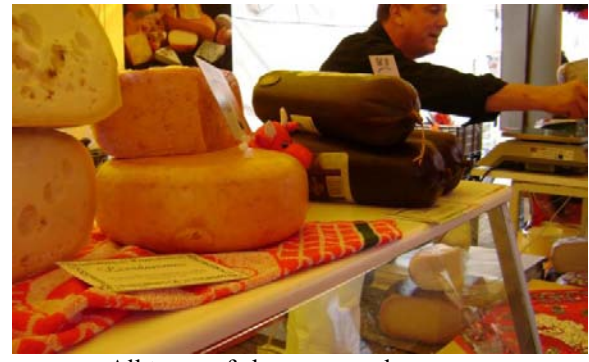
All types of cheeses on sale