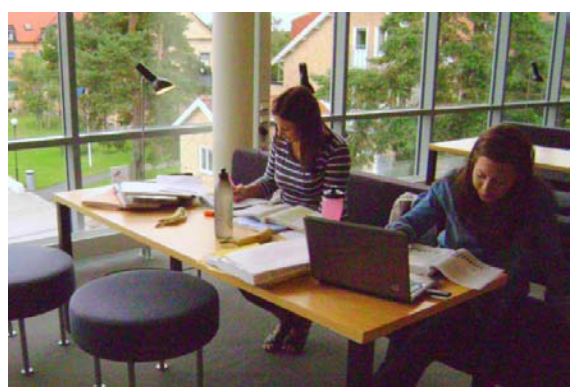
Students studying in the university library

Overall, I was impressed with the ambience and welcoming atmosphere of the libraries, the ergonomic furniture and the university library's well-stocked photocopying room.