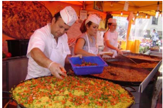
Yummy Italian paella on offer at the market

The local people were always helpful, friendly and approachable whenever I was lost or needed assistance.