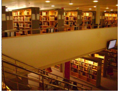
Inside University West's library