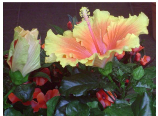
A rare hibiscus in a florist's shop