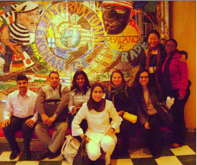
Posing with a few grantees before we headed to the University of Boras for the Global Librarian Satellite Meeting