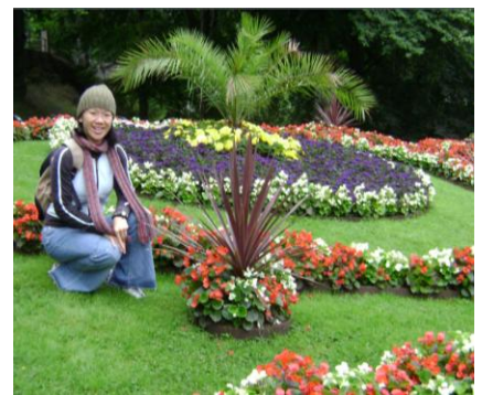
Appreciating the colorful gardens in Boras

My first impression of Boras was of a quaint little sleepy town. Of course my room was not ready given my very early arrival. Putting my bags in the hotel storage, I ventured onto the cobblestoned sidewalks of the town. Into the park adjacent to the hotel I went taking numerous pictures of the vibrantly colorful flora. In no time did I adapt to the rainy welcome of Boras as my home town is on the rainier side of Fiji. Over the course of the day, I met up with a few grantees who had arrived the previous night and as our numbers increased, we explored the town centre, its many shops and accidently located the University of Boras School of Library and Information Studies building.