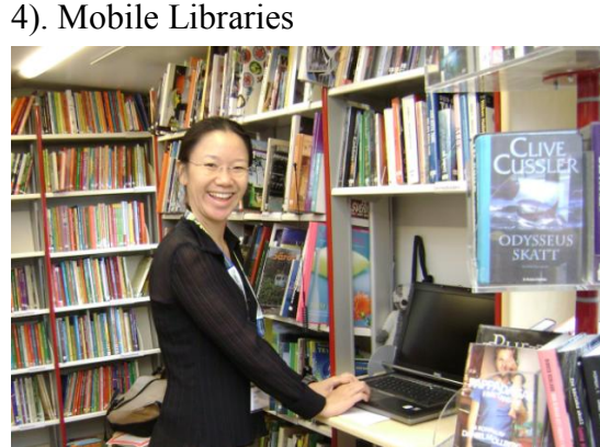
Enjoying the interior of a mobile library