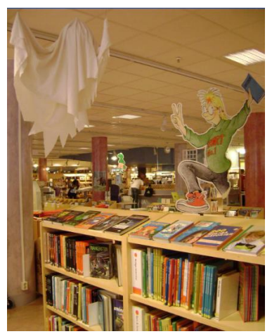
Creative librarians make reading interesting

During my spare time, I visited Gothenburg City library and was amazed at the inclusiveness of the teenagers section.