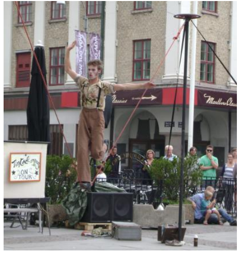
A street performer keeps the crowd captivated