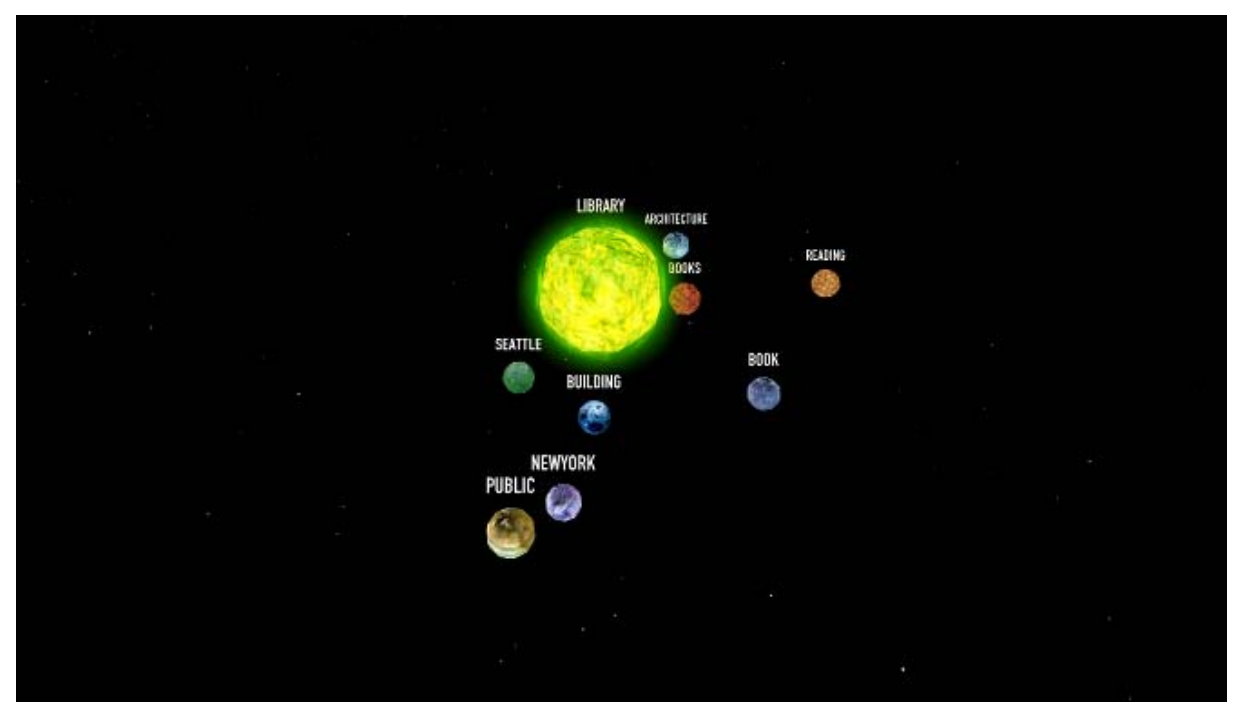
Figure 3: Tag Galaxy browser (http://taggalaxy.de/)

techniques. A good example of using 3D layout is the Tag Galaxy browser (Tag Galaxy, n.d.) (Figure 3).