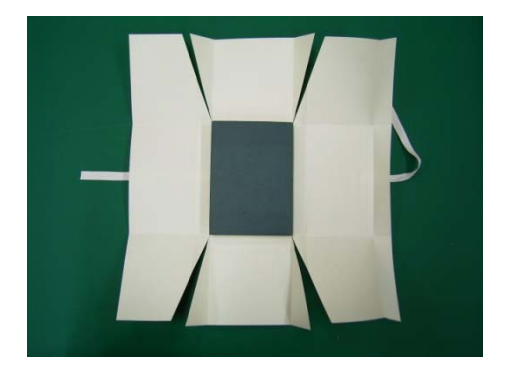
Figure 6 Four-flapped folder introduced at workshops