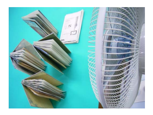
Figure 4 Book stood on its end and interleaved