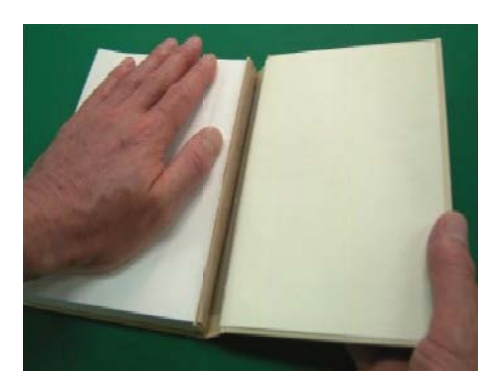
Figure 2 The tube glued on the spine