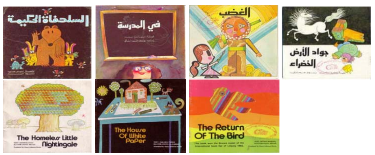
Books by Dar Al Fata Al Arabi

The specialized publishing house Dar Al Fata Al Arabi, the first of its kind, stood out in the publishing landscape of the time. Since its founding in 1970, it imposed criteria to ensure quality, and put forward authors and painters committed to improving the children's book in both content and form, but above all to revolutionizing the role and the message of the children's book.