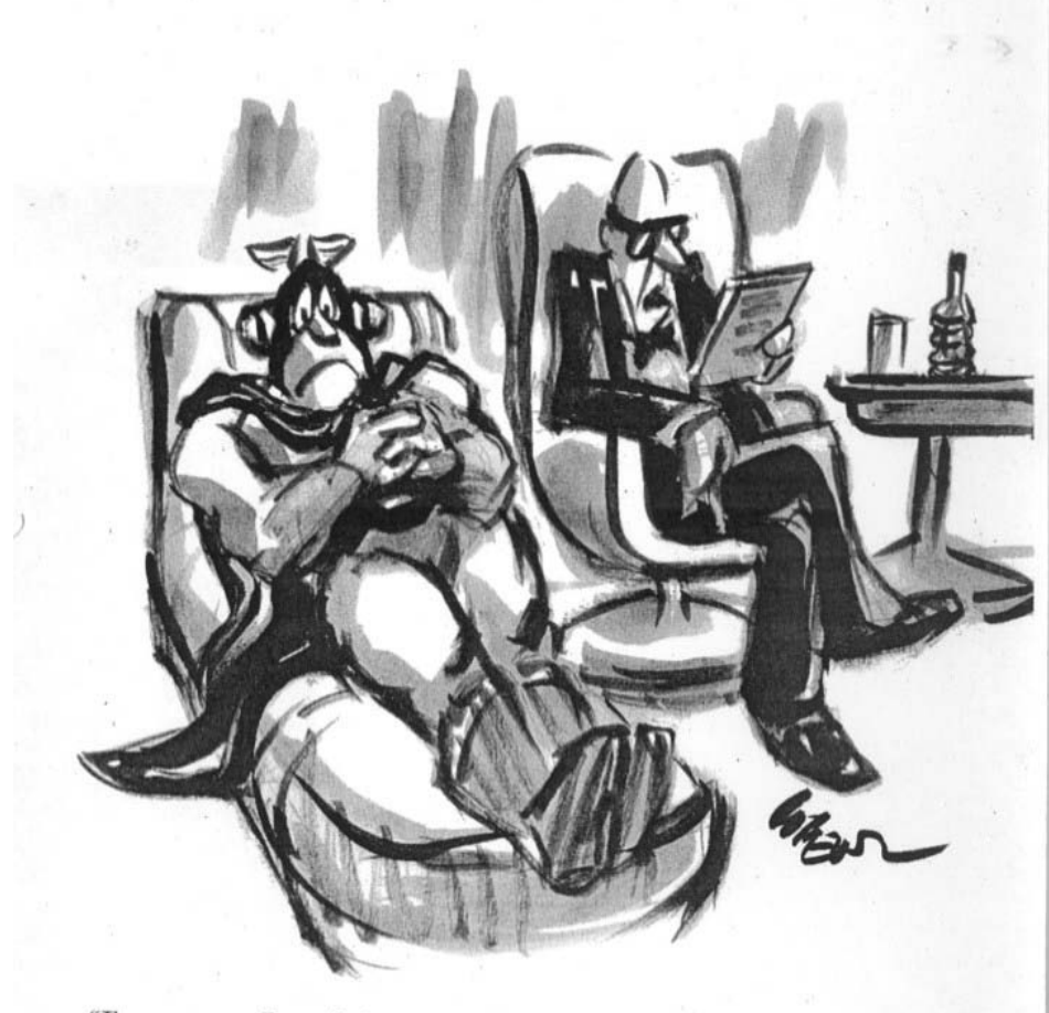
"I'm not sure I can help you—all your issues seem to be copyright-related."