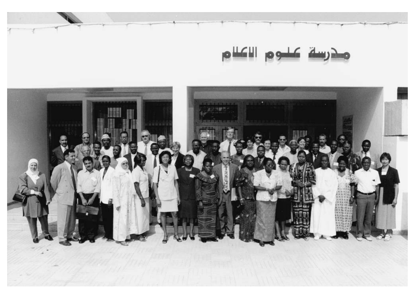
The conference participants

The African Information Society Initiative (AISI) vision is the creation of a sustainable information society in Africa by the year 2010 (UNECA. Africa's Information Society Initiative (AISI) , para.18). The AISI goals are to create an enabling environment which facilitates the development of Africa's informa-