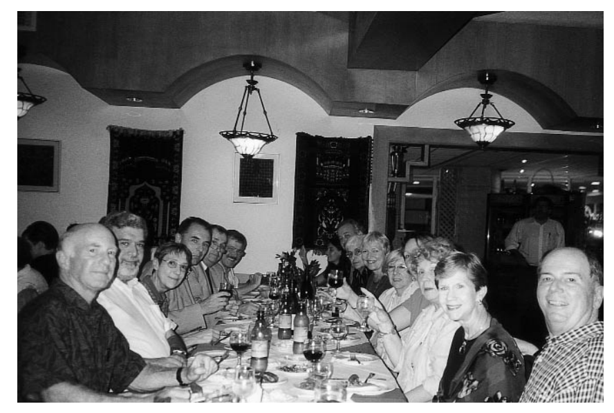
Professional Board at Week's End

In the international copyright debate, IFLA represents the interests of the world's libraries and their users. Copyright law impacts on most of what libraries do. It affects the services that libraries can provide to their users, and the conditions in which they can provide access to copyright materials. It affects the way in which libraries can act as navigational agents and undertake effective archiving and preservation activities. It is for these reasons that IFLA participates in the international copyright debate. During the conference the IFLA Executive Board adopted a Position Paper on Copyright in the Digital Environment. The full text of the statement can be found in this issue of IFLA Journal and