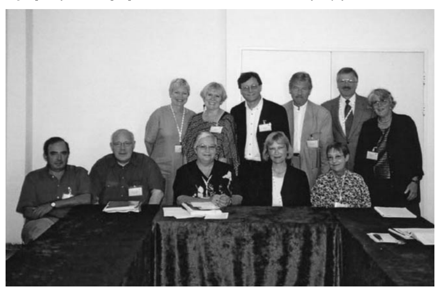
Conference Planning Committee with Norwegian Delegation: "Yes, It Will Be in Oslo in 2005!"

It was a very difficult decision for the Executive Board to make, but I am pleased to announce that the 2005 IFLA Council and General Conference will be held in Oslo, Norway. I am sure that the 2005 Conference will be a very exciting and interesting conference for all IFLA participants. An enthusiastic team in Norway will ensure that your stay in Oslo will be very enjoyable."