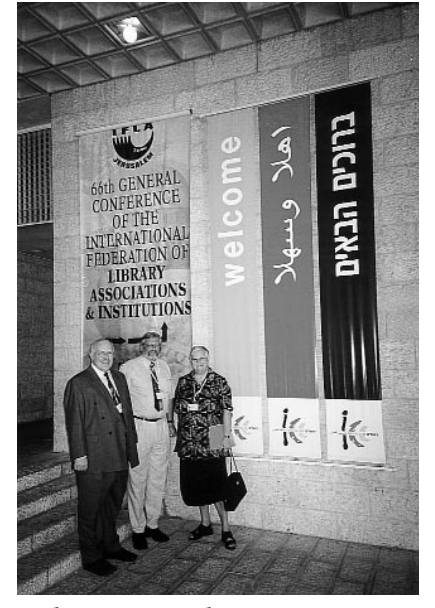
Welcome to Jerusalem