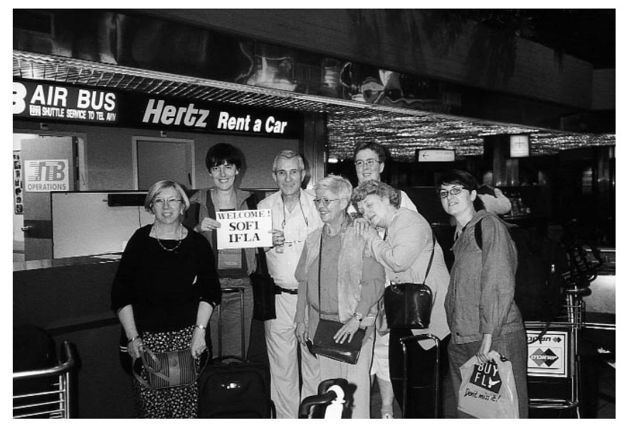
IFLA Staff Arrive in Israel

ence, and am particularly glad this gathering is assembled here in Jerusalem in the year 2000.