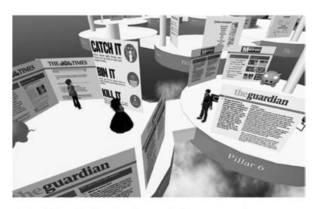
Sheila's students show visitors round a model of the 7 Pillars of Information Literacy

We have both taught students in SL as part of the formal curriculum. In this section we will describe the ways in which we have worked with them, and identify some benefits of using SL.