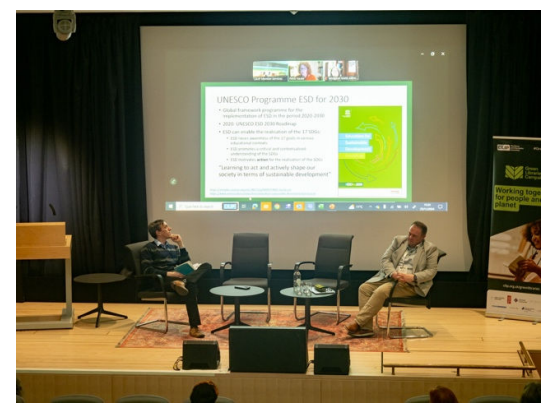
Global Green parallel session.

As well as three plenary presentations on the theme of 'Sustainable Collections and Climate Literacy'. this year's programme included parallel sessions in the morning and in the afternoon, with a choice of three session each time. Our speakers covered a wide range of topics. including the British Library's recently launched 'Sustainability and Climate Change Strategy', Glasgow Women's Library's 'Net-Zero Handbook', building a sustainable supply chain from a library and publisher perspective, library and information professionals' contribution to the 'Greener NHS' programme, the power of public library partnerships and the sector's contribution to the Sustainable Development Goals.