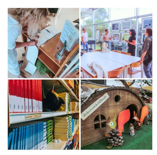
Impressions from the Collserola Josep Miracle Library, Barcelona