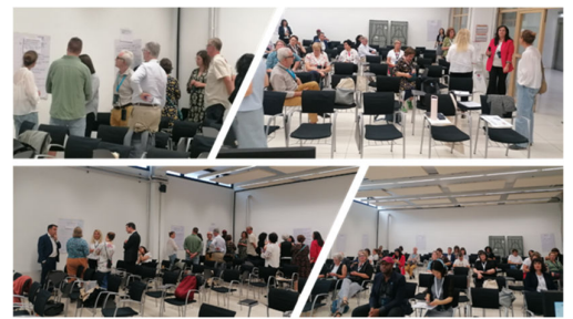
Attendees of the whorkshop Libraries at the frontlines of Climate Action and Sustainability @Rosario Toril

Pun (Macao SAR). Thomas Felton used the example of Cleveland (USA) to show impressively how city libraries can be integrated into and promote a strategy for sustainable urban development.