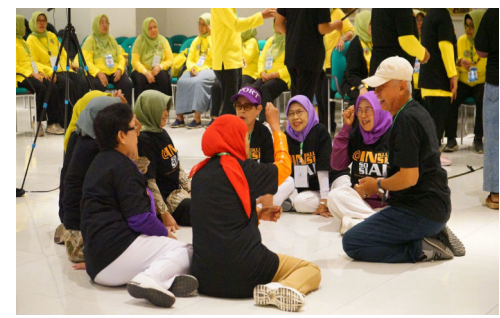
Workshop for the elderly: "Cheerful Elderly, Happy Elderly, Elderly Refuse to forget" held by The National Library of Indonesia, October 2024.

knowledge and experience in the fields of affiliation and Artificial Intelligence in social media or e-commerce.