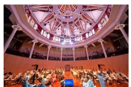
The Auditorium of the Industrial School of Barcelona.

The main topics addressed included the role of public libraries in democracy, censorship in heritage collections, strategies for reading, writing, and oral expression, urban planning, sustainability, and climate action. Awards were presented for the "Best Public Library in the World" and the "Best Green Library." In addition to presentations, roundtable discussions, and workshops, participants visited prominent libraries in Barcelona and Girona. Over 400 attendees from nearly 50 countries participated.