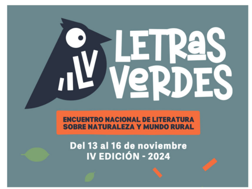
Poster announcing the Conference

highlighting literature's power as a tool for change.