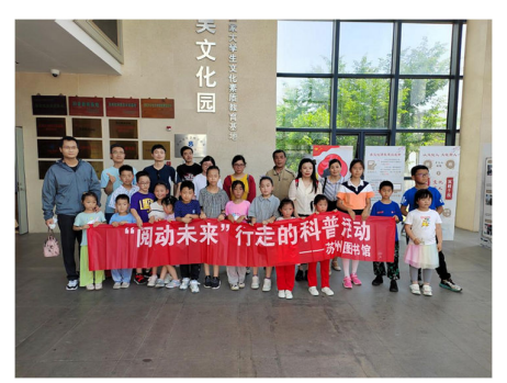
Visit to the science popularization education base.

The on-site teacher gave an in-depth explanation of popular science knowledge such as modern green energy technology. At the same time, readers deepen their understanding and experience of green energy application technology through on-site experience and knowledge interaction.