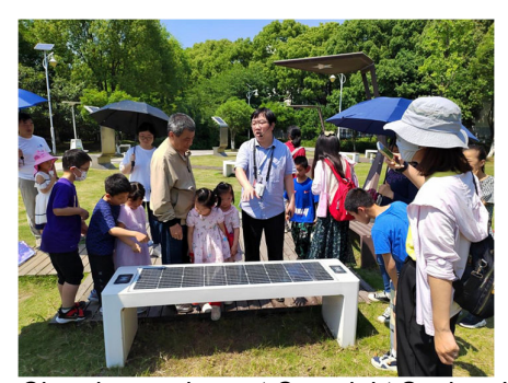
Charging equipment

The on-site teacher gave an in-depth explanation of popular science knowledge such as modern green energy technology. At the same time, readers deepen their understanding and experience of green energy application technology through on-site experience and knowledge interaction.