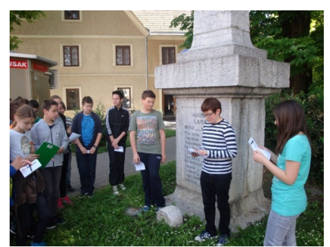
Detail from the workshop.

One example of interdisciplinary collaboration is the workshop "Students – Tourist Guides in Their City," which was organizes in Elementary school Dubovac in Karlovac. The workshop linked Geography class, English class, and research work in the school library. Seventh-grade students had to choose a monument or building in Karlovac, research basic information and interesting facts about it, and prepare a short presentation in english. The librarian and teachers prepared the necessary materials (printed and online), and then took the students on a city walk. While one student gave the presentation, the others "pretended" to be tourists, taking notes on questions prepared on the worksheet. So they practiced to orient themselves in the city, to give public presentation in english, to get familiar with the cultural heritage of their own city, and to selfevaluate their understanding of what they had seen and heard.