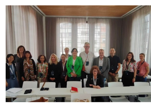
Attendees of the ENSULIB meeting

Ten of our twenty-four Ensulib Standing committee members were able to take part in the conference. At our section's business meeting, the status of the section's work was presented and future projects within the framework of the IFLA strategy were discussed. Specifically, reports were given on the planned book publication on ESD (Education for Sustainable Development), the Green Library Guidelines, the planification for the Green Library Award 2025 and ideas for planning the WLIC 2025 in Astana (Kazakhstan) were also collected.