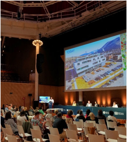
Presentation of the awards and winners

More information about the nominated libraries can be found on the Ensulib website.