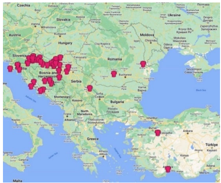
Putting your town on a world map together with other project partners

Considering the recent arrival of foreign students (migrants, returnees) in our schools, such a collection would serve as an addition to the local heritage collection offering a source for learning and getting to know the new living and cultural environment. Both mentioned collections, in addition to being available in the library, can also be in a virtual environment, as well as databases of links that can be integrated into the library's website, containing relevant materials about tourism, the promotion of other cities and countries, their customs, culture, landmark and so on.