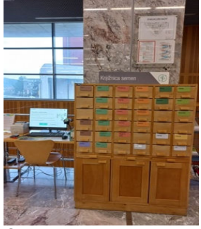
Seed Library in France Bevk Public Library Nova Gorica.

At its core, the Seed Library is a collection of ecologically raised, homegrown seeds, that community members donated to the library. We took it a step further and with minimal resources developed an innovative computer application, which allows circulation of seeds and their traceability. Its user-friendliness allows patrons to use it independently. Patrons log in to the app by scanning their library card and afterwards can borrow or donate seeds through the app. All the entered information is available in the Seed Library catalog on the library's website.