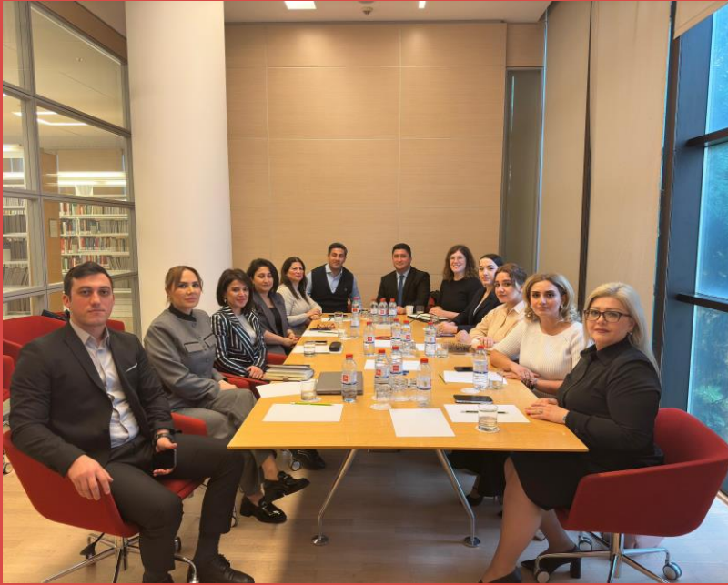
Within the library field