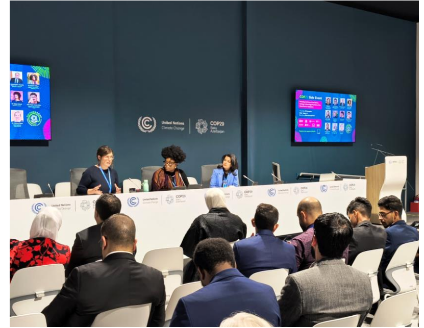
Beyond the Library field