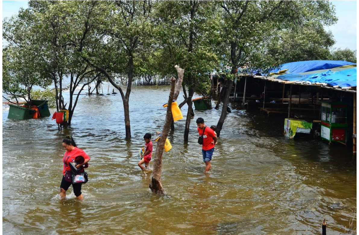
Sea Level Rise in Jakarta, December 2024.