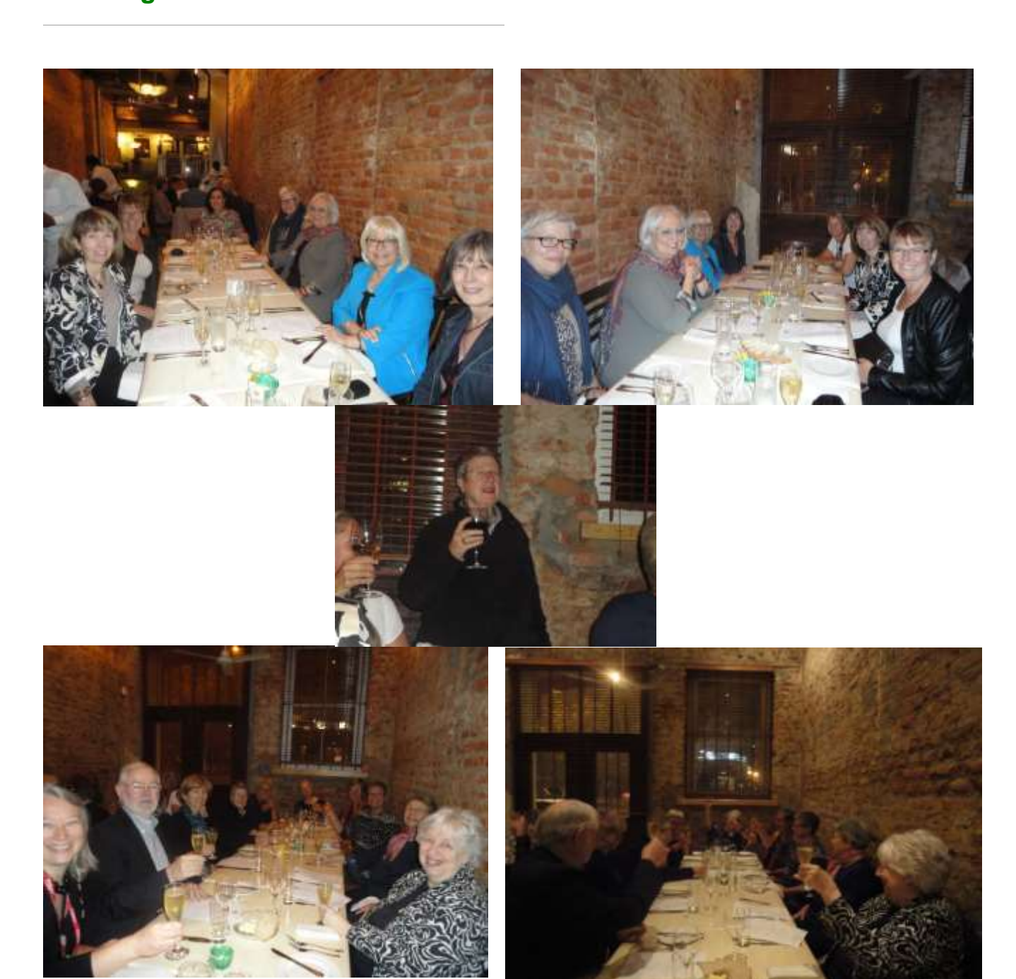
Taking time for strengthening formal and informal relationships while tasting local food