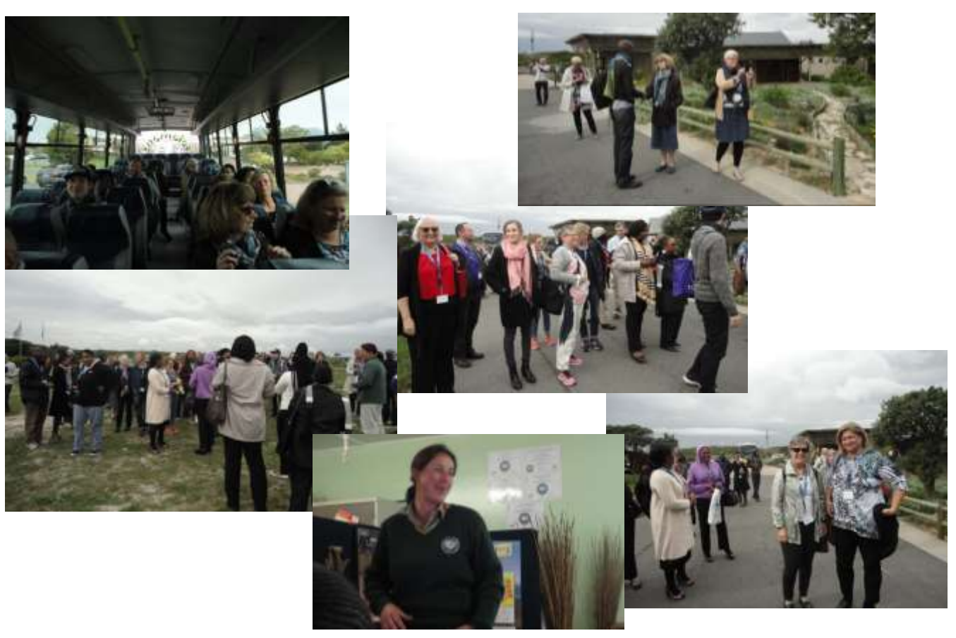
Enthusiastic tour guide