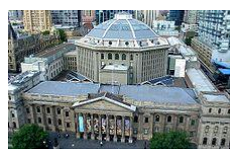
The State Library of Victoria, Australia

In 2009, more than 150 eager genealogists (the largest group ever) attended the sessions, a number of them travelling from regional Victoria. There were also a big contingent of public librarians and staff from other agencies. Almost 1,000 people in total have attended the six Feasts held since 2004.