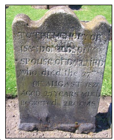
Tombstone inscription ending...'2 Rooms' Dunfermline, Scotland