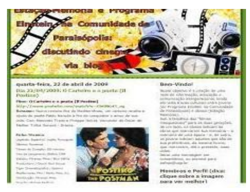
The Blog: www.estacaomemorianausp.blogspot.com

These older people had selected four movies and had shown these to the group of adolescents, between a relation of twenty and four commented movies featured on the Memory Station's blog