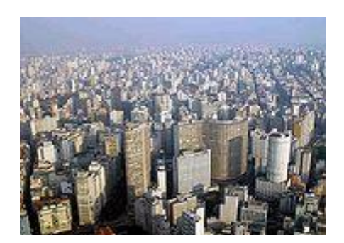
Downtown region of Sao Paulo

The isolation of the generations can be compared to a vision of books without readers or, in other terms, of histories without listeners. We should therefore reflect on this disconnection between children, adolescents, adults and the elderly, and on possible forms of intervention and cultural mediation between the different generations. Our project considers and studies intergenerational relations in a contemporary age - from the formation of a net connecting older people, children and young people to the exchange of life experiences, wisdom and a worldview linking different age groups.