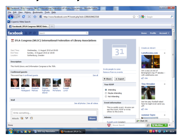
Six Facebook attendees so far!......