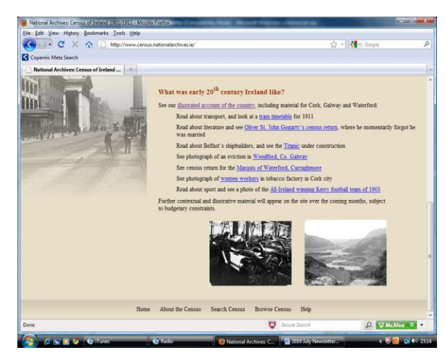
The National Archives: Census of Ireland 1901/1911

census was taken on 31<sup>st</sup> March 1901. This is the oldest surviving complete census for Ireland. The 1911 census was taken on 2<sup>nd</sup> April 1911. Now digitized these details are freely available to view and search.