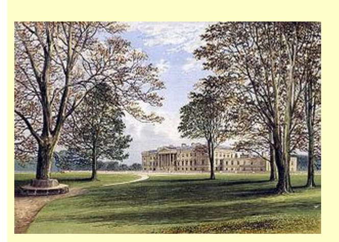
Hamilton Palace, Scotland c 1880