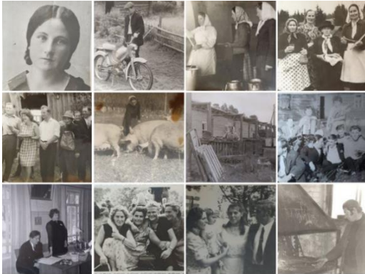
Library history and local history: Cibla Library photo gallery from community shared personal pictures

The fact that libraries actively collect local history materials from the population: photographs, memory stories, etc., is nothing new. And it was logically that Library Week was used to actively ask the population to get involved and to share with various materials for the aim of local history work.