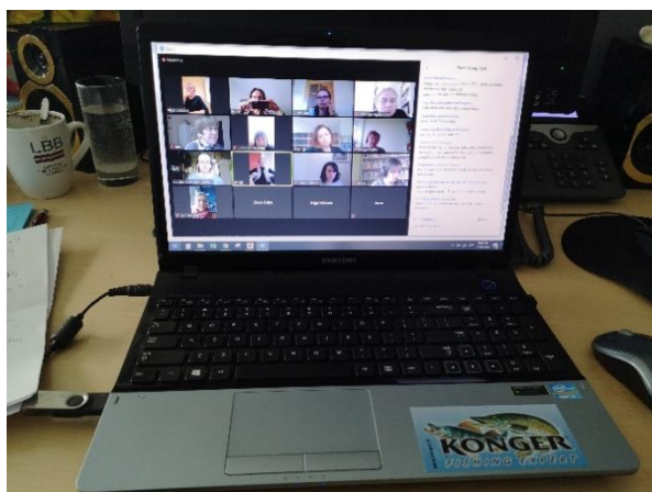
Webinar - online seminar during the Library Week in Latvia