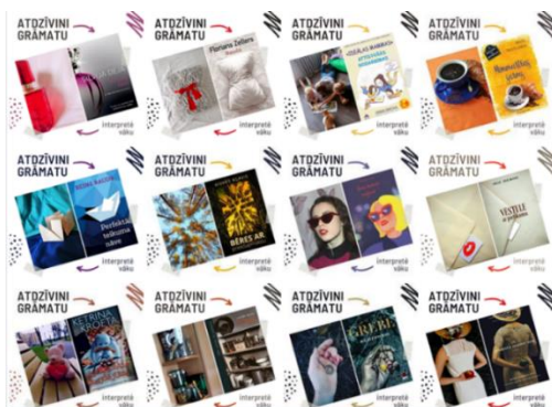
“Revive the book – interpret the cover, an activity of the Latgale Central Library