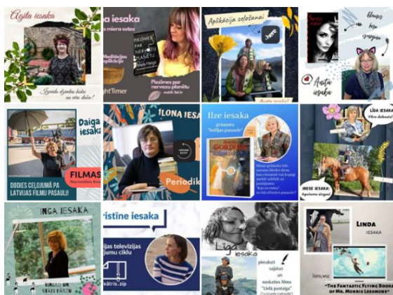
Valmiera Library activity - The Librarian Recommends