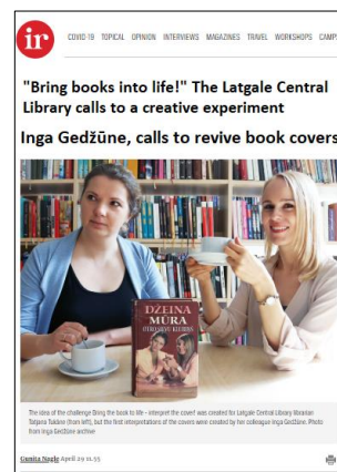
Publication on IR - Latvian National Magazine