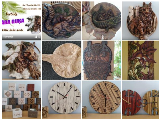
Virtual exhibition of Staicele Library