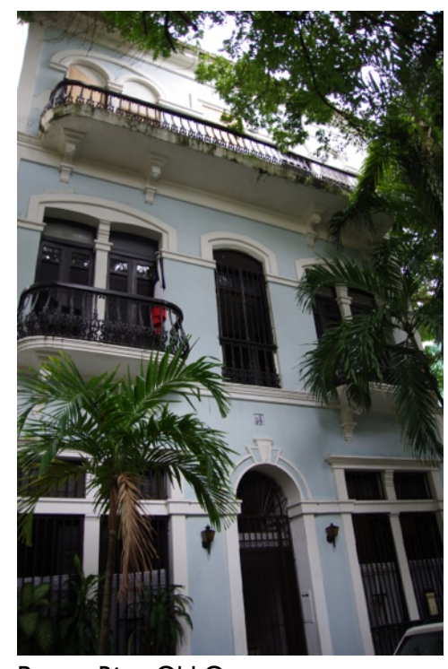
Puerto Rico, Old Quarter