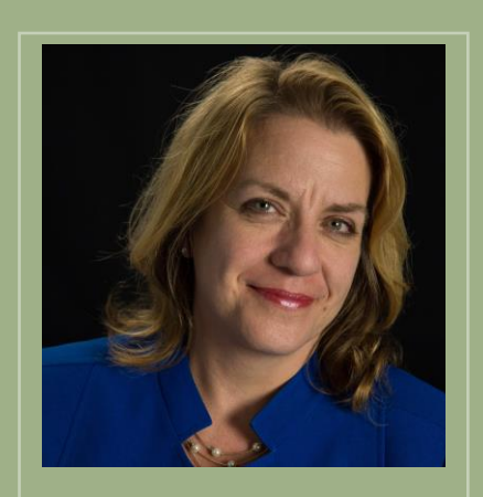
Featuring IFLA KM Section Member