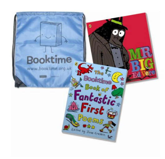
BOOKTIME For 4-5 year olds