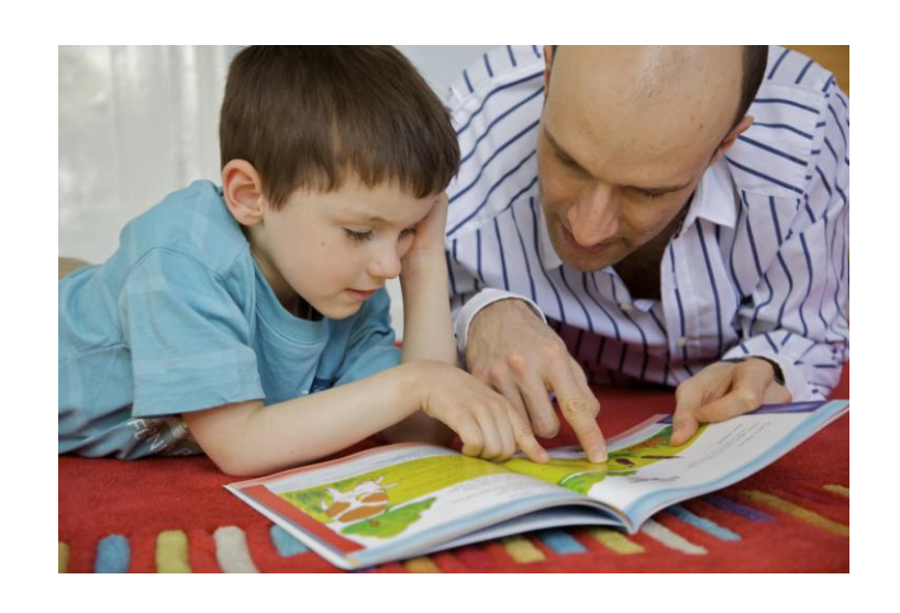
CHILDREN IN HOSPITAL AND CHILDREN'S HOSPICES