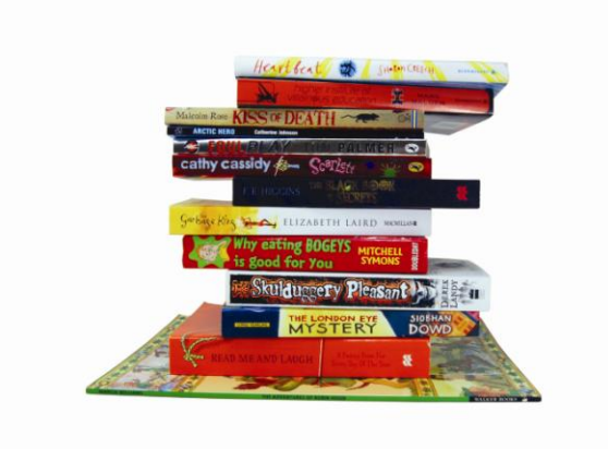
BOOKED UP A choice of one book for 11 year olds

3 packs for every child: 7-9 months Bookstart Baby 2 years Bookstart+ 3 years Treasure Chest