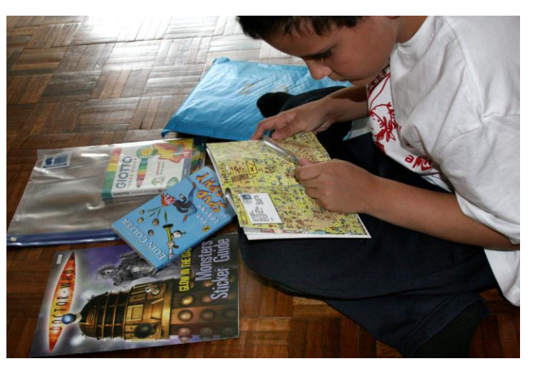
LETTERBOX CLUB for children in public care aged 7-11 years