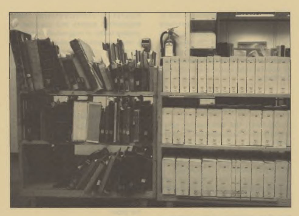
Right: phased conservation boxes.

the original dimensions existing before the fire. It was discovered by this test that an average of 4 mm compression was achieved by using a one kilogram weight. If a boxing technology could be designed that would produce custom fitting boxes and not increase the added thickness by more than 4 mm, no extra shelf space would be required. There was no such technology that could meet such demands.