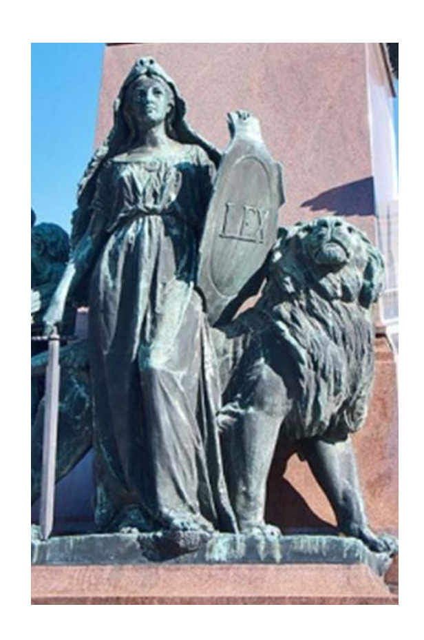
The figure representative Law (Lex), Senate Square, Helsinki

The right to Information is ensured in the present Finnish Constitution Section 12 (2)