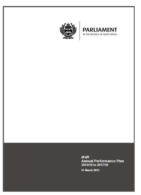
Tabled documents on www.parliament.gov.za