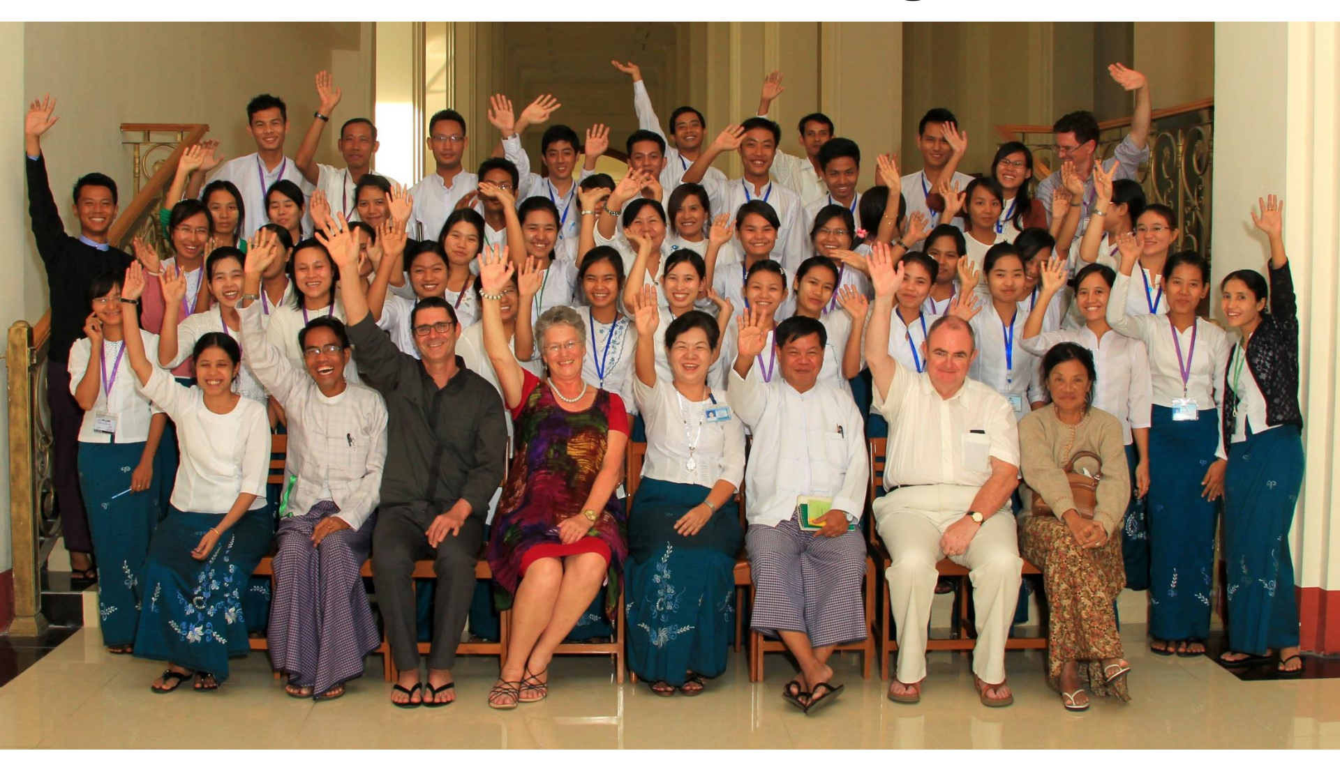
September 2013 with international experts from NZ, and UK House of Commons