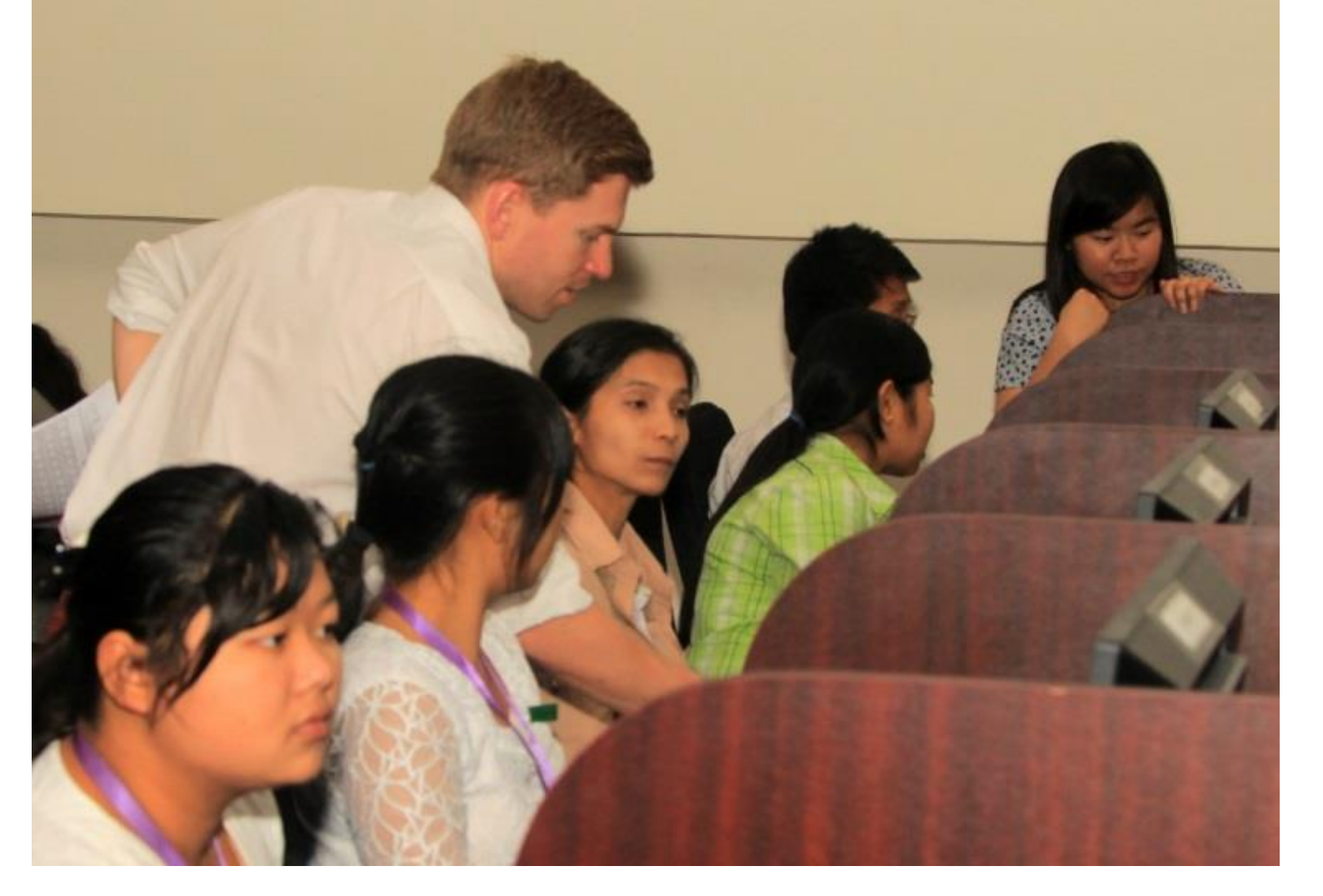
EARLY LRIS DEVELOPMENT IN 2013