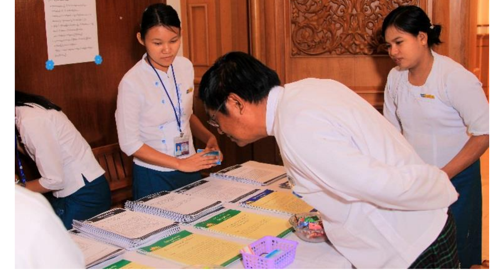
CREATING A RESEARCH SERVICE IN 2014