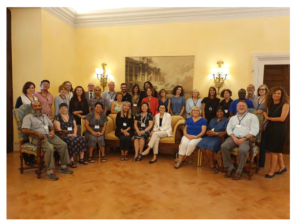
Fig. 8. Satellite participants