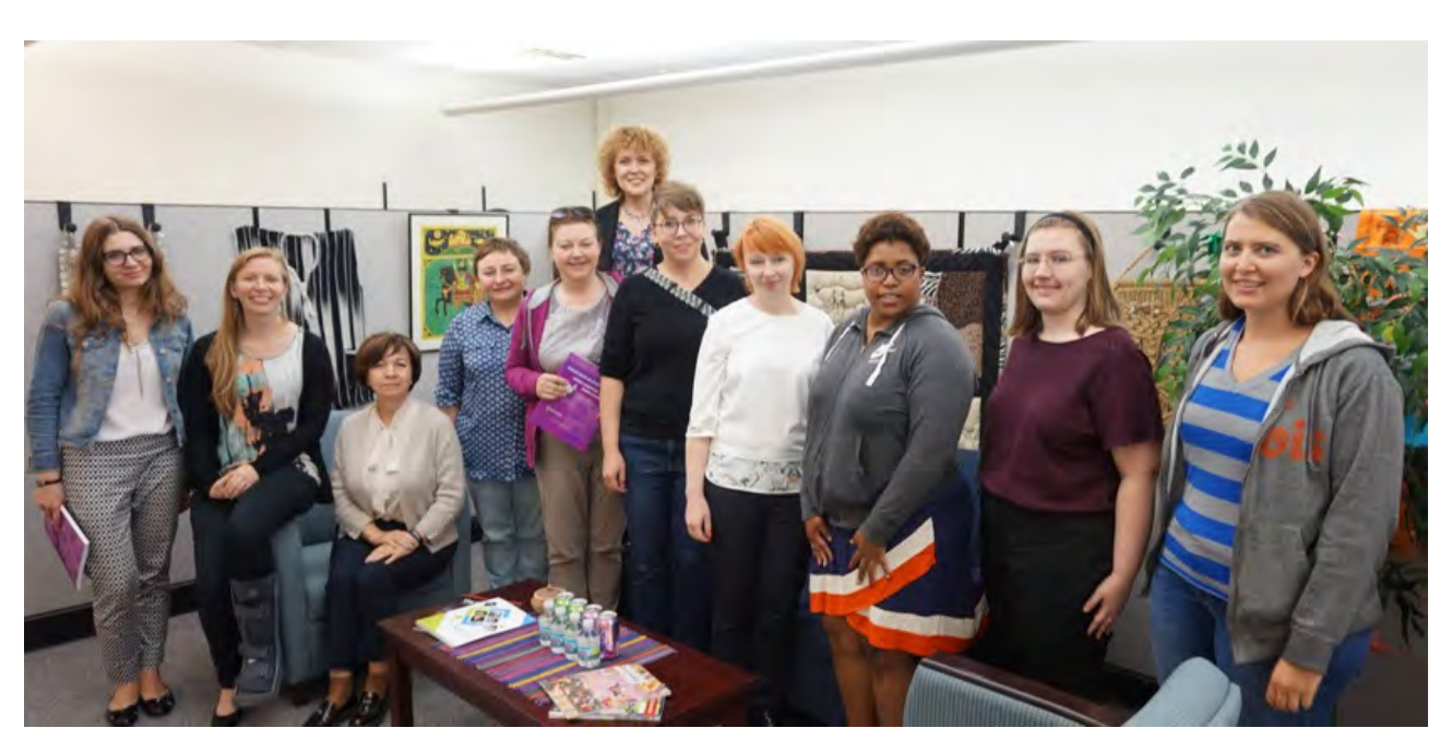
Russian delegation with Illinois iSchool Students 2019

Libraries bridge divides in communities and connect with everyday people like no other institution, not only educating individuals but also creating economic and civic opportunities for local communities. Both Russian and US librarians are working to increase the capacity of communities to solve collective problems. Through the dialogue and joint training work we continue to learn from each other how to deepen the practices in our home countries while also building bridges of understanding between them. During a period of divides between our two countries our library dialogue is a perfect example of how individuals can take the matter into their own hands in order to rekindle rich and deep relationships between the Russian and American people.