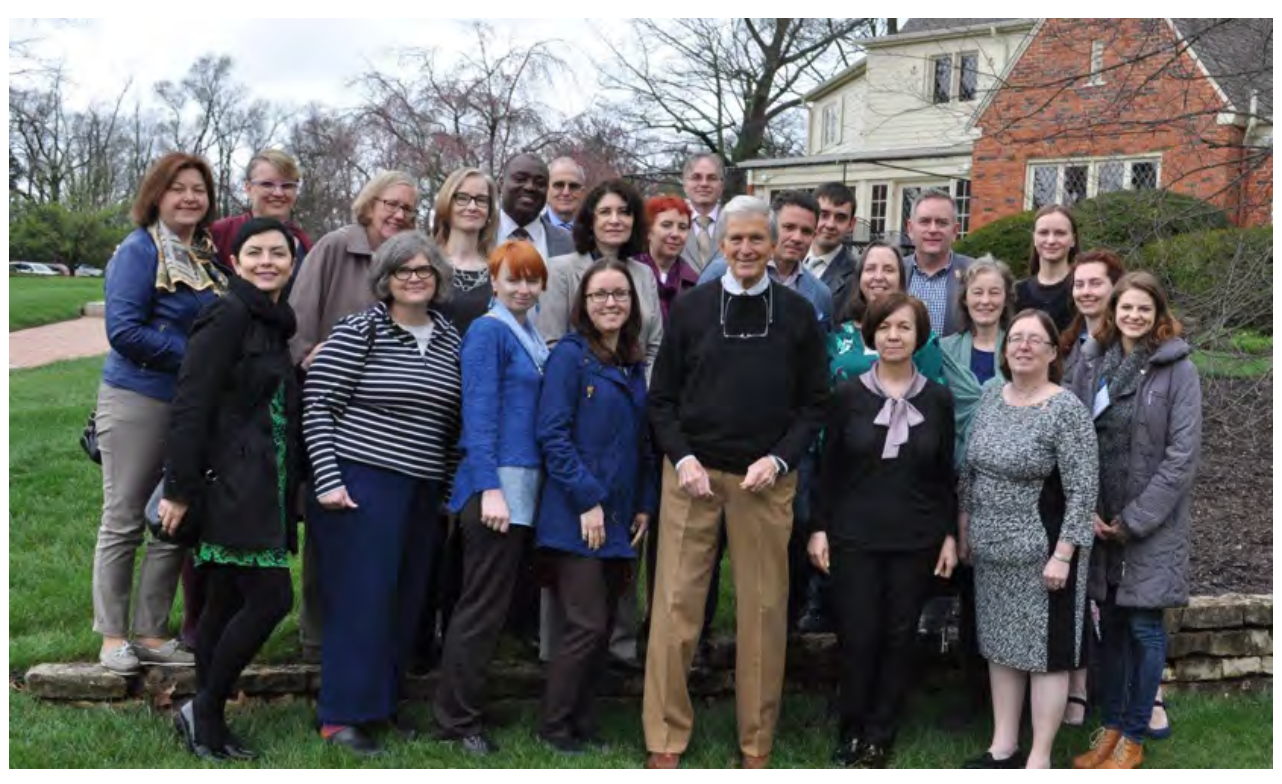
2017 Dialogue Group—Dayton, Ohio, USA

In the September 2019 meeting participants discussed ways their libraries have been working to address many of the UN SDGs, with a particular focus on Goal 4: Quality Education, and Goal 16: Peace, Justice and Strong Institutions—specifically target 16.10: Ensure public access to information and protect fundamental freedoms, in accordance