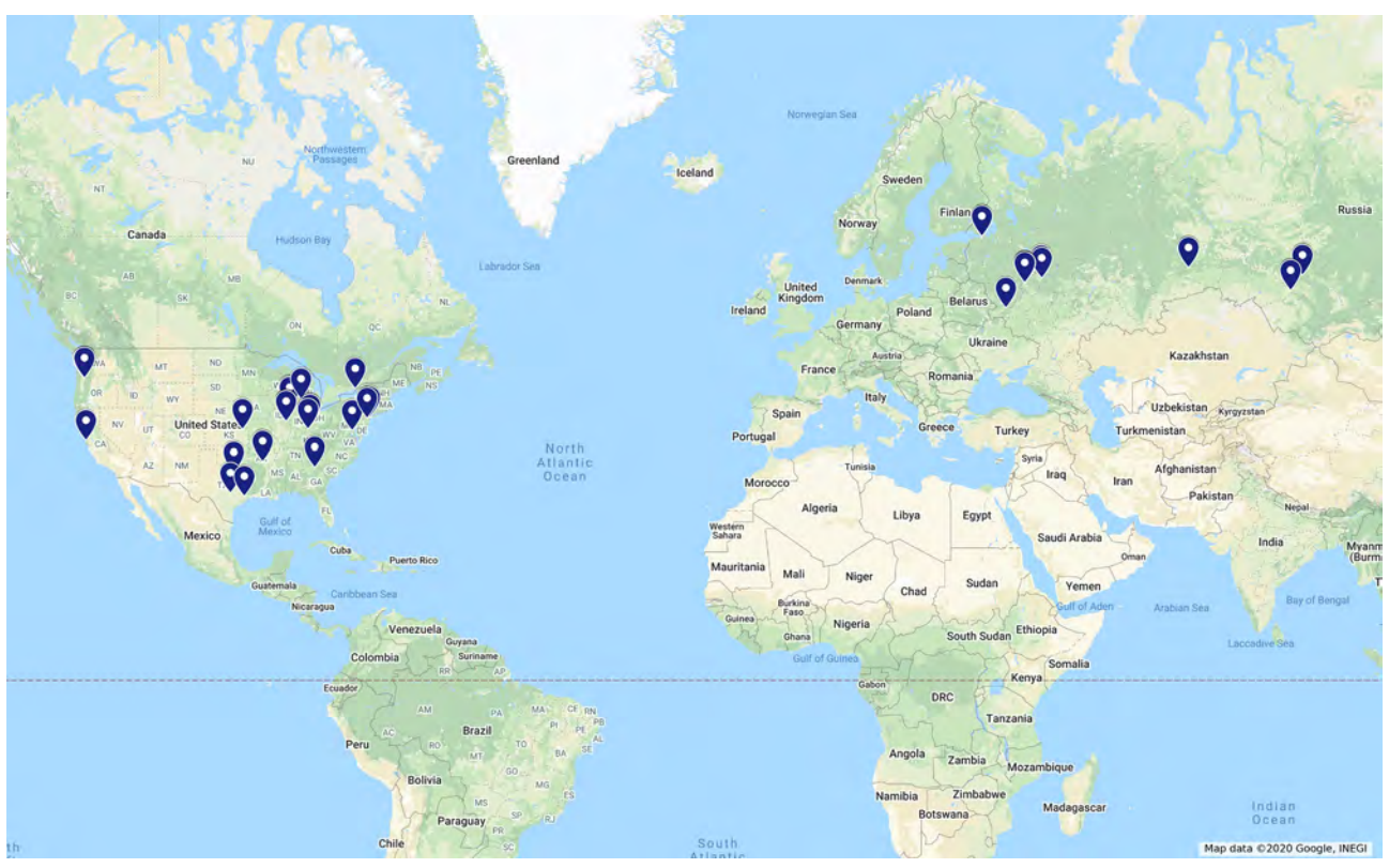
US Russia Library Dialogue Map

meeting was supported by the US Russia Foundation and brought together 20 library leaders and specialists from five Russian regions and seven US states and the District of Columbia. This meeting brought the total number of participants over the three meetings to 45 people (21 Russian, 24 US), coming from 29 libraries and organizations. We came from 7 Russian regions (8 cities) and 11 US states and the District of Columbia (17 cities) and 1 Canadian province. See the map below for the cities represented. Twenty-eight participants were at one meeting, 13 were at two, and 4 were at all three.