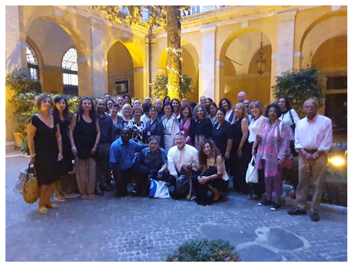
Fig. 7. Satellite participants

The Satellite at the Vatican was a beautiful experience, the participants have had the ancient but dynamic context of the Vatican Library for LIS ever-changing community. Usually Satellites bring new people to know IFLA and the activities of its Sections. Those who fail to participate in the IFLA WLIC can have the opportunity to participate in the Satellite. So this happened for the Satellite at the Vatican Library.