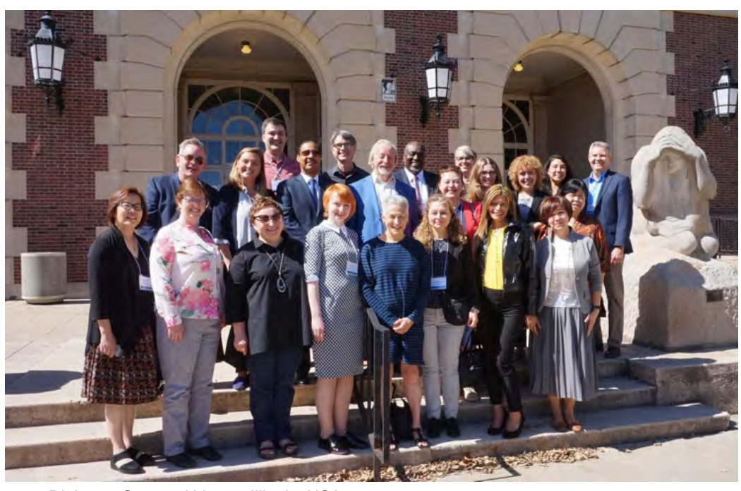
2019 Dialogue Group-Urbana, Illinois, USA

The US-Russia Library Dialogue developed out of partnerships that began more than 20 years ago and culminated in a first binational library-focused meeting at the Charles F. Kettering Foundation in Dayton, Ohio in March 2017, which then was recognized as a working group of the Dartmouth Conference. Since 1960 Dartmouth has reinforced the bonds between US and Russian citizens, emphasizing cultural and educational exchanges as an effective means for enhancing mutual understanding and fostering relationship building and diplomacy. Building off the successful first meeting in the United States where we shared experiences with engaging communities and developing skills necessary for a 21st century library, we held a second working meeting at the Russian Library Association's (RLA) Annual Congress in Suzdal, Russia in May 2018 to deepen the relationship and learning between the two countries' library delegations. In September 2019 the third working meeting of the US-Russia Library Dialogue met at the University of Illinois Main Library in Urbana, Illinois. This two-day