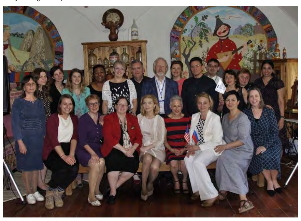
2018 Dialogue Group—Suzdal, Russia